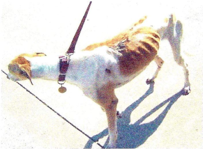
Whiskey - succumbed to Ehrlichia