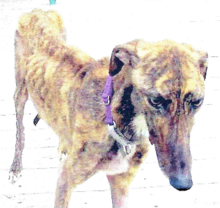
Apple Martini – succumbed to Ehrlichia